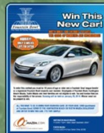
Win This New Car